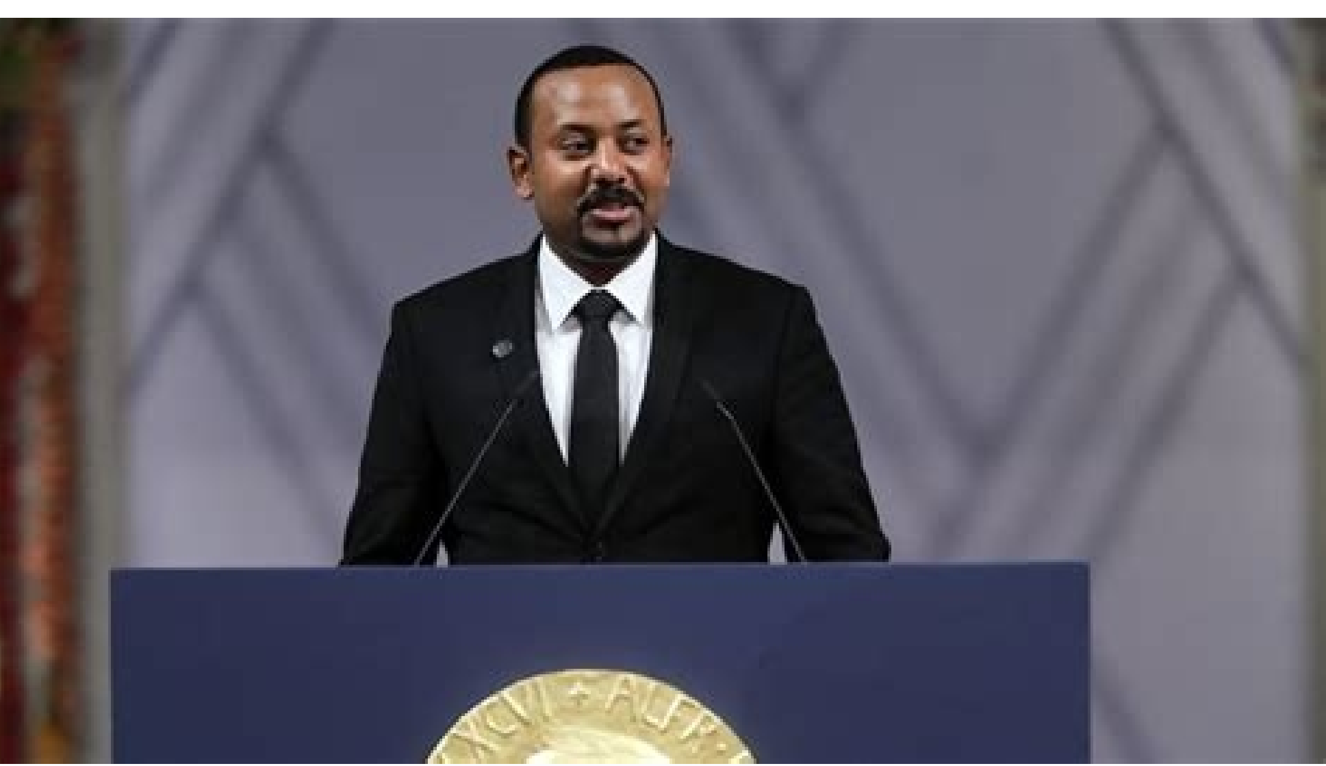
The Ethiopian reporter english news.